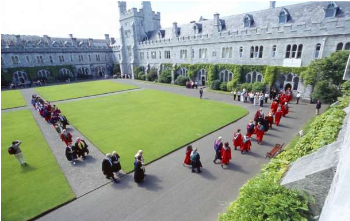
The Main Quadrangle