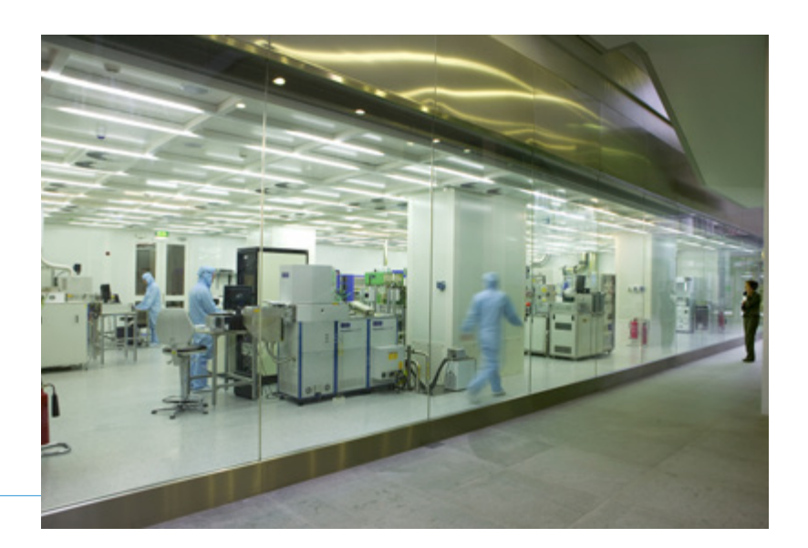
Cleanroom facility at Tyndall National Institute.

industry-led research centres, including IPIC (Irish Photonic Integration Centre); CONNECT (Research Centre for Future Networks and Communications); and MCCI (Microelectronic Circuits Centre Ireland). These centres fully encompass the mission of the Institute, that is of representing a critical link between academia and industry, in order to expedite the development of new technologies and their market exploitation. The Tyndall community are important actors at European level, with key representation at high-level groups, scientific councils and European technology platforms. We have been contributing to the development and implementation of the strategic agendas of ESTHER (Emerging and Strategic Technologies for Healthcare), AIOTI (Alliance for Internet of Things Innovation), AENEAS (Association for European NanoElectronics Activities), EPoSS (European Platform on Smart Systems Integration ) and Photonics21.